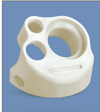
Figure 1: Klock Werks Bezel

A common question that is asked is, “What is DDM?” The question arises because consensus on many aspects of the process, including what to call it, is lacking. Over the past few years, the term direct digital manufacturing has become more commonplace. Yet, alternatives are still routinely used. When discussing DDM, many will use terms such as rapid manufacturing, additive manufacturing or free form fabrication; all of which are synonymous to DDM. Stratasys, Inc., has elected to adopt DDM because this terminology clearly distinguishes the technology from all others. Additionally, this decision supports the Society of Manufacturing Engineers (SME), which has endorsed DDM as the preferred name for this unique manufacturing approach.