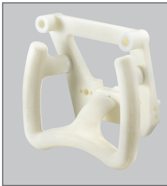
Figure 2: BMW Jig