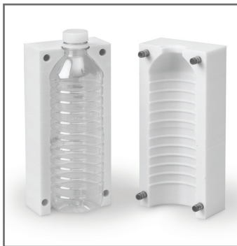
Figure 3: Injection Blow Molding in polycarbonate plastic

As the name implies, DDM is a process that uses additive fabrication technologies, such as FDM, to manufacture parts. In other words, DDM produces the components that go into the products that a company sells. Yet, the concept is still maturing so there is some disagreement as to what the scope of DDM is and how to define it. However, at Stratasys, DDM is defined as a process that is used to perform one of the following three manufacturing functions: