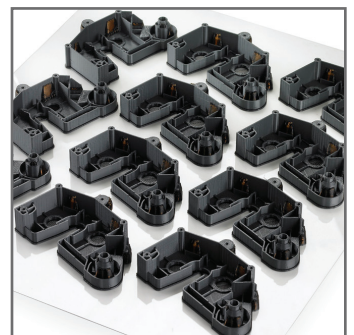
Figure 5: Short-Run Manufacturing

Because there is no tooling, short-run manufacturing principals may be used. This on-demand strategy reduces inventory levels and minimizes losses when product modifications are implemented (figure 5). Also, companies may change the design at any time, and as frequently as desired,