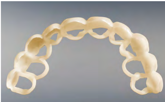
Figure 5. VeroGlaze produces functional dental veneer try-ins.

VeroGlaze™ has an opaque, white color that is listed as an A2 in accordance with the Vita shade guide used in dentistry. The shade and properties make VeroGlaze an ideal material for realistic veneer samples (Figure 5) that allow the patient and doctor to visualize the results of a prosthetic prior to performing the treatment.