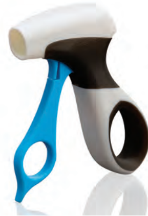
Figure 7. Digital ABS Plus features heavily in this design verification prototype for medical devices. This surgical prototype also features Agilus30 overmolding in black for superior grip and a 3D printed color handle, printed separately. Digital ABS Plus has heightened impact strength from Digital ABS, leading to improved functional performance.

By blending rubber materials with Digital ABS Plus or Rigid Opaque, the range of properties expands dramatically, from soft-touch with subtle color to decidedly un-rubber-like materials that offer 10 Shore A hardness values ranging from 35 to 100. Counting the options for color, there are hundreds of digital material options for rubber.