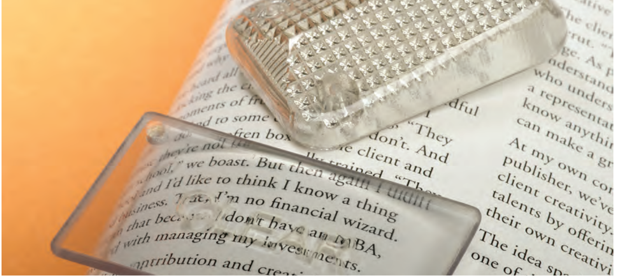
Figure 2. VeroClear produced these lenses.