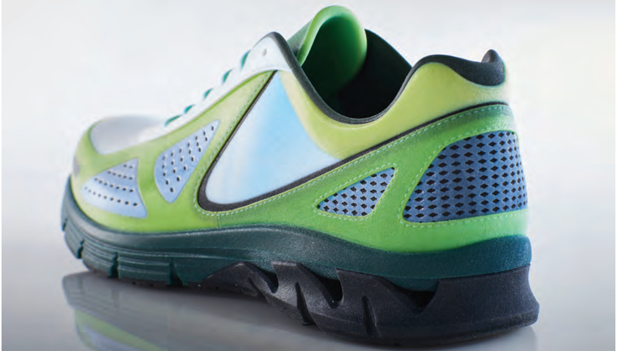
Figure 1. This full-color multi-material athletic shoe was 3D printed in one piece and represents a range of Shore A values.

Material options and proven applications in the PolyJet world have expanded greatly in recent years, so it's reasonable to expect a great deal of experimentation among customers. For optimal success, it is important to understand the mechanics and best practices for PolyJet photopolymers and their corresponding 3D printing platforms.