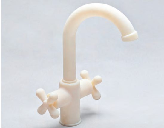
Figure 6. High Temperature material can withstand hot fluids.

Four of the five are Digital ABS Plus™, and these are discussed in the Digital Materials section. The fifth is a material that can take the heat.