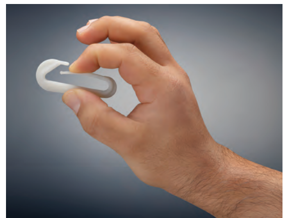
Figure 3. Rigur material was engineered for prototyping polypropylene products.

This PolyJet material has been formulated for improved dimensional and visual characteristics as well as greater strength. Parts made from Rigur are bright white (Figure 3) and have better surface finishes than Durus. This makes Rigur great for visual applications, and its higher temperature