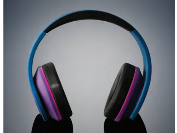
Figure 4. The rubber pads on these headphones have a soft Shore A value of 27. The full model was 3D printed in one piece.

There are four materials in the Tango family, and two materials in the Agilus30 family, offering harnesses that range from 27 to 75 on the Shore A scale, which is comparable with rubber bands to tire treads and shoe heels. Rubber-like materials come in black (Figure 4), gray and a semi-translucent off-white.